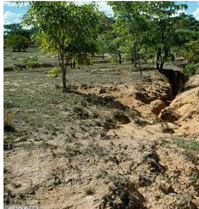
Natural ground cover removed allowing run-off to go unchecked.